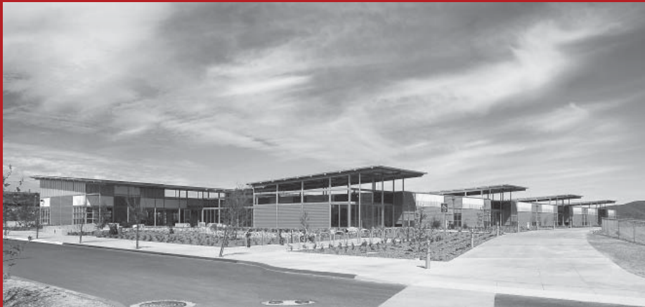
High Tech High in Chula Vista, CA

Built to Code With Shorter Build Times – The bottom line is that with modular construction you can get a facility built to the same local codes with construction quality as good as or better than a comparable site built building in much less time. Additionally, the abbreviated construction schedule allows you to get a return on your investment sooner, while minimizing the exposure to the risks commonly associated with protracted construction schedules.