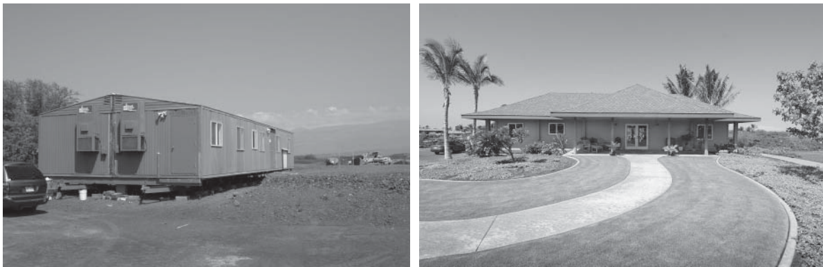
Before (left) and after (right and below) pictures of the Brookfield Homes Sales Office in Kona, HI

Of course, the modular construction industry has for many years been practitioners of flexible design and reuse. At its annual Awards of Distinction competition, the Modular Building Institute hosts a category for best “renovated reuse” of an existing building. Renovated reuse is defined as a reconfiguration of an existing factory-built commercial structure to meet the needs of an application that is different from its original design.